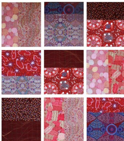
Pink Quilt layout