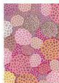
Dancing Flowers pink