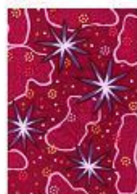
Wild Fruit, pink