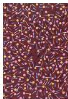
Damper Seeds, brown