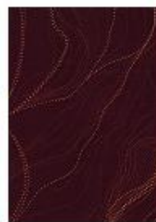
Sand Hill, brown