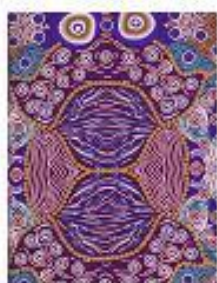
Bush Coconut, Purple