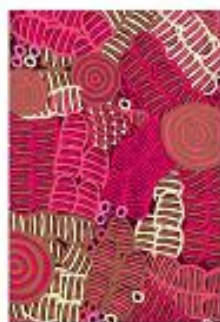
Bush Melon, pink