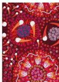
Plum and Bush Banana, dark red